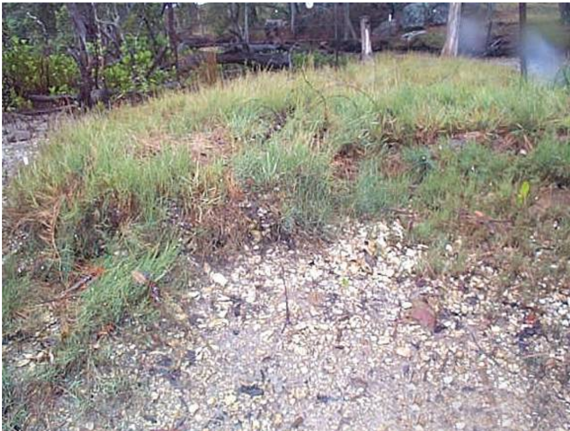
Shell midden.

Middens are amongst the most fragile cultural sites. They can be exposed by wind or degraded by human and animal activity. Effective management of midden sites may include stabilising the surface, such as by encouraging vegetation cover, or by restricting access to the site by erecting fencing.