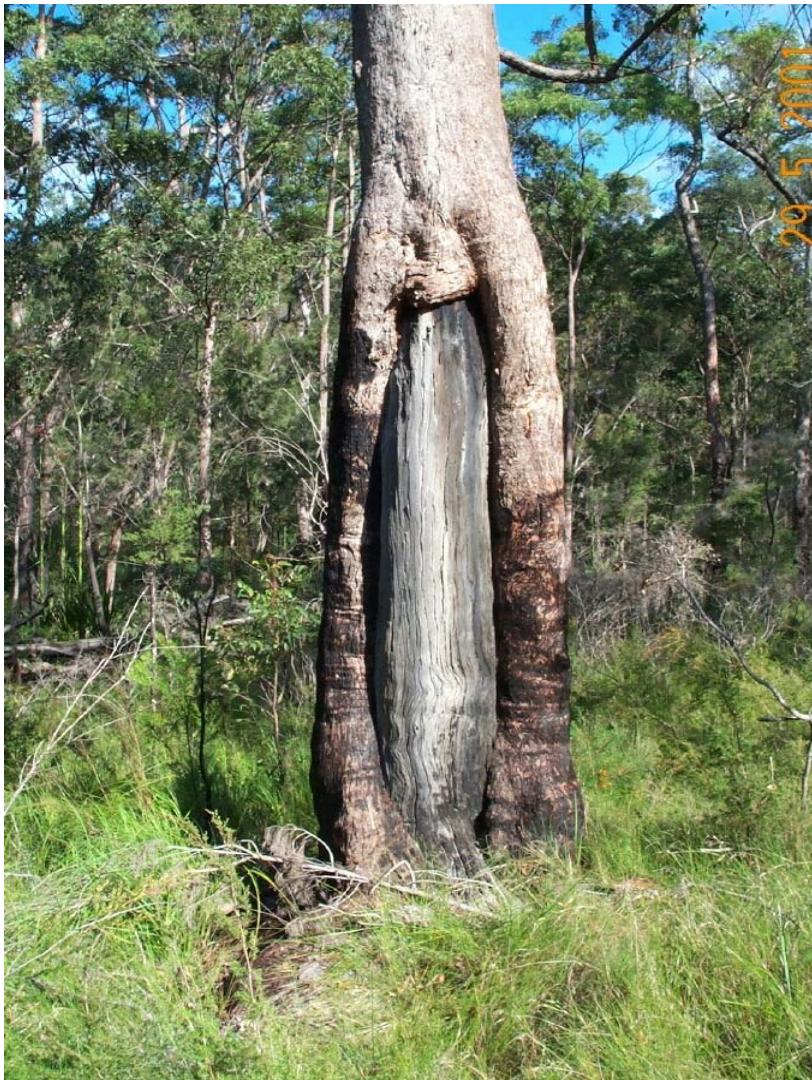
Carrington scarred tree.

It is important to note that the defence to a prosecution contained in Clause 80B of the NPW Regulation relating to certain low impact activities does not apply in relation to any harm to an Aboriginal culturally modified tree. Ensuring that Aboriginal culturally modified trees are not harmed will likely include ensuring that effective buffer zones are used, as their significance is often part of the broader landscape.