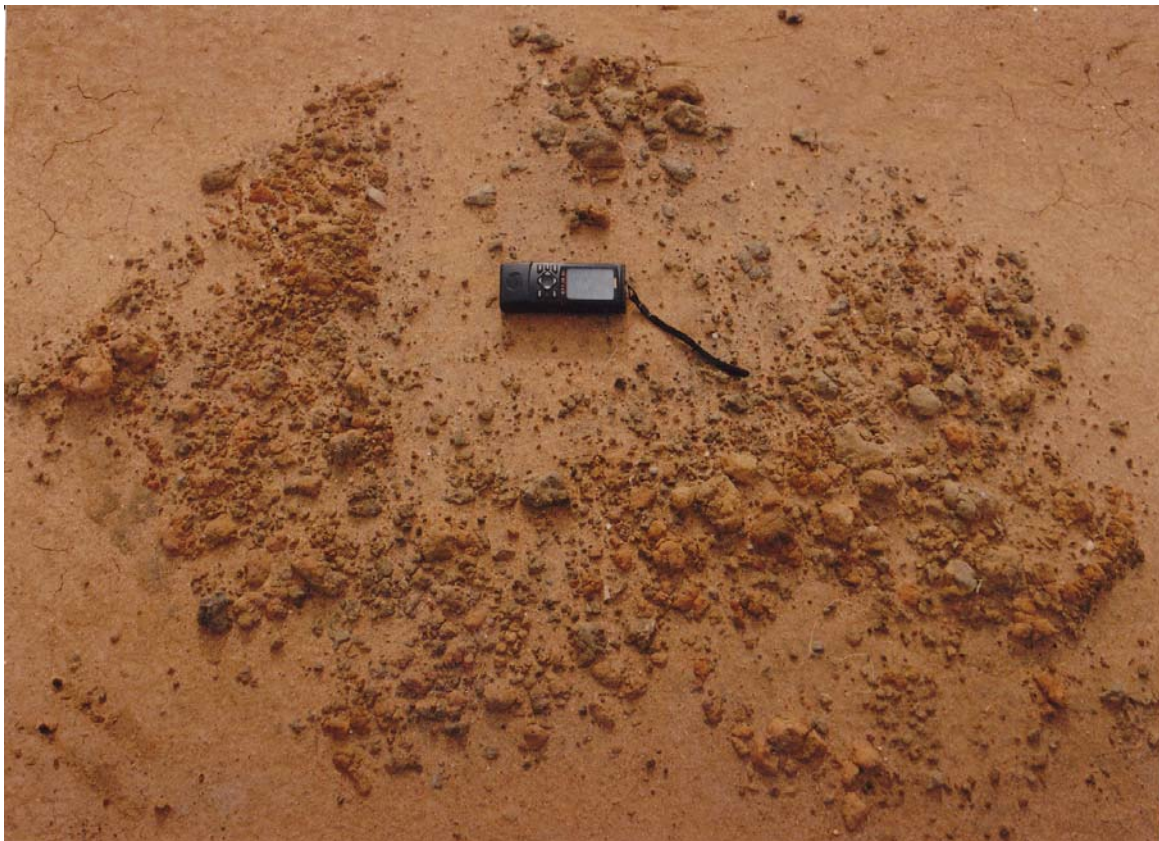
Hearth site. Stephen Meredith

These hearths are roughly circular piles of burnt clay or heat fractured rock with associated charcoal fragments, burnt bone, shell and stone artefacts.