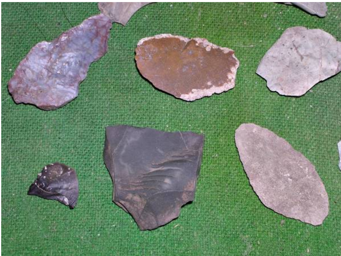
Stone artefacts.

Stone artefacts are often small, so they can be difficult to protect. Erosion and weathering caused by activities such as ditch digging and ploughing can disturb stone artefacts. They can also be broken when trampled by animals, or when run over by vehicles.