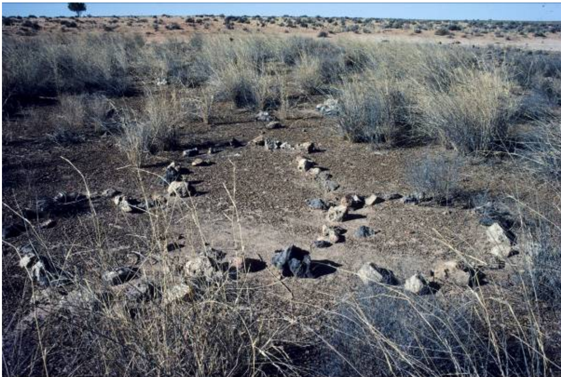
Stone arrangement.

Management options around Aboriginal stone arrangements can include stock, weed and erosion control.