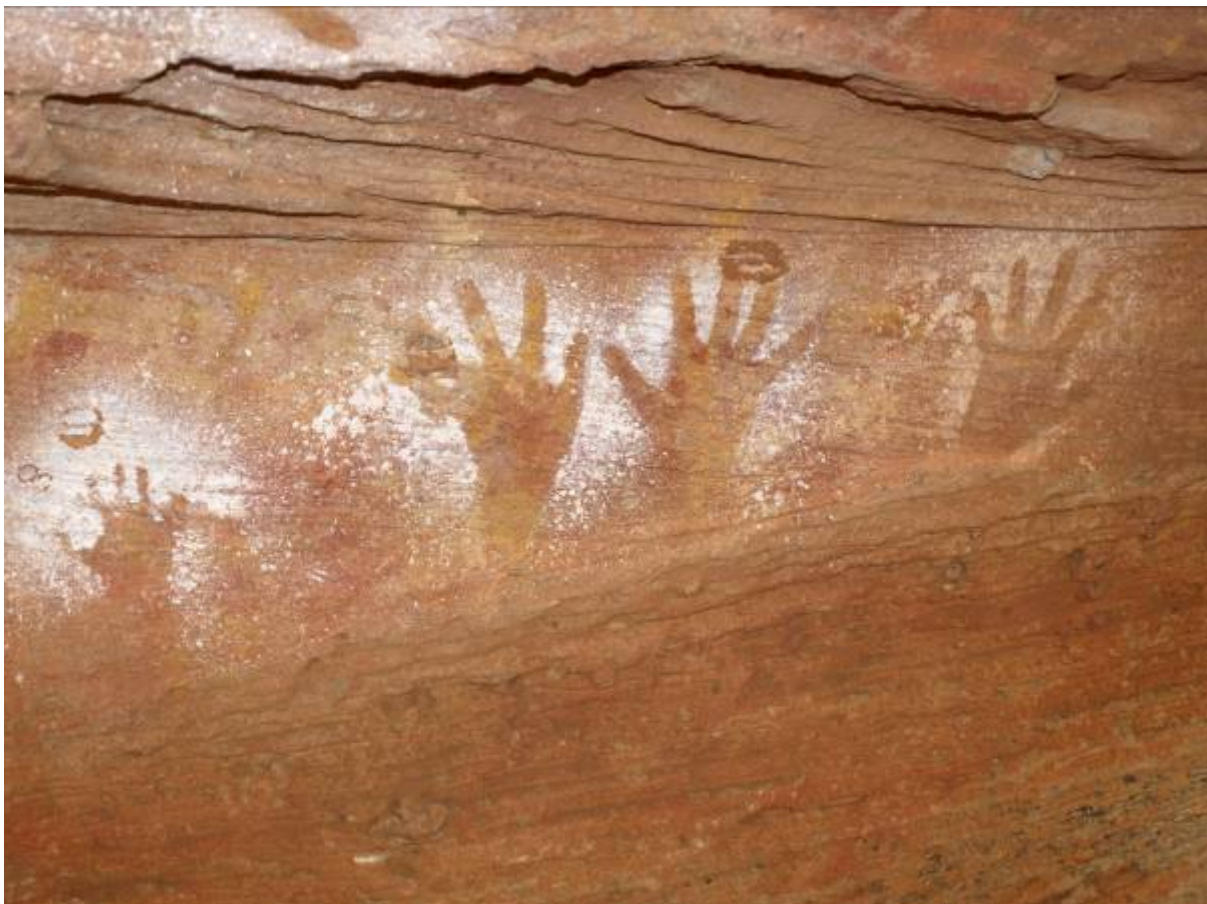
Mutawintji hand stencils.

Rock art sites can be easily damaged as they can be prone to erosion and vandalism. Touching rock art or disturbing a shelter floor in the immediate vicinity of the rock art can cause damage, as can movement on or over surfaces with rock art. Sites may also suffer from vegetation growth or removal. Effective management of rock art sites can include drainage, fencing, graffiti removal, and visitor control.