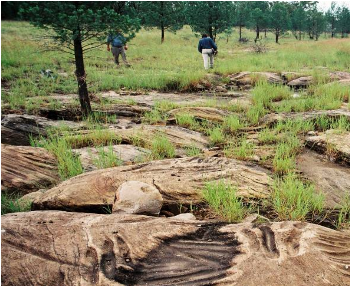
Axe grinding stones.

As sandstone is relatively soft, it is prone to weathering, erosion and trampling by animals. Human activities such as mining, road infrastructure, damming, clearing, ploughing and construction can also destroy these sites. Management options can include stock and erosion control.