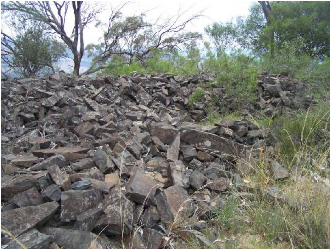
Daruka axe quarry, Tamworth.

Aboriginal quarries can be protected by management actions such as by controlling stock and managing erosion.